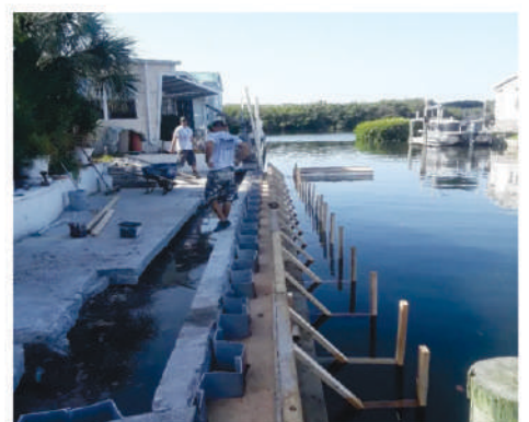
Dams, Sea Walls & Marine applications