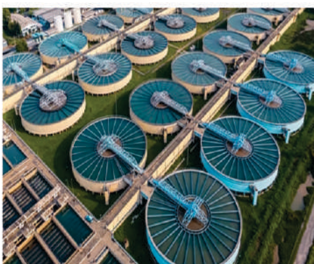
Water & Waste Water Treatment Plants