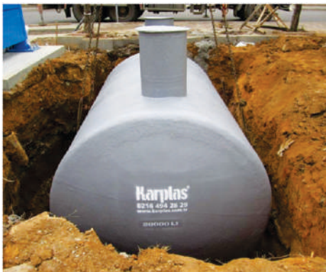
Underground Water Tanks