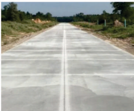
RCC Floorings built In or Close to the sea