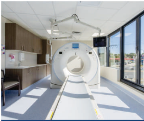
Hospital MRI Areas