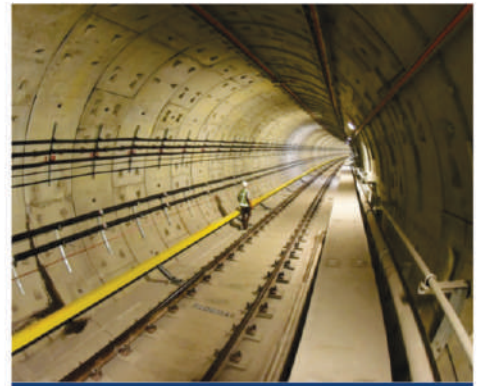
Tunneling & Temporary Reinforcement